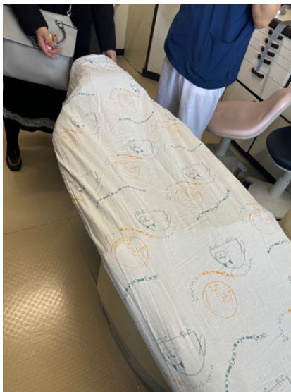
7-kilogram weighted blankets