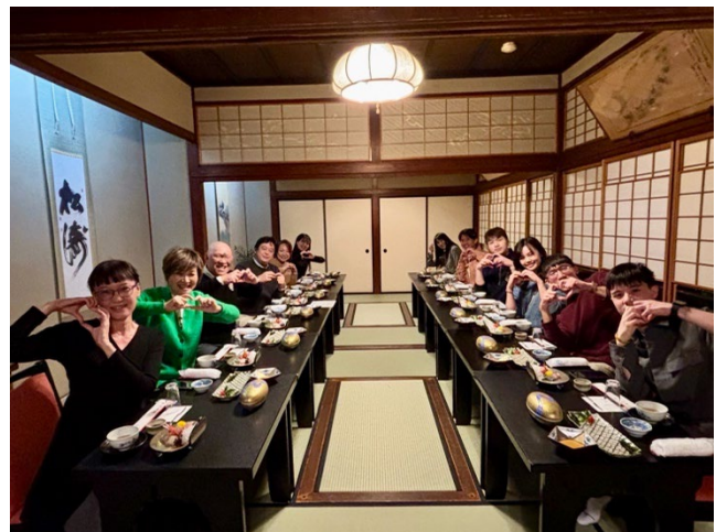
Visit to Masuda Sake Brewery (榊田酒造店), and its partner bar, café, and restaurant.