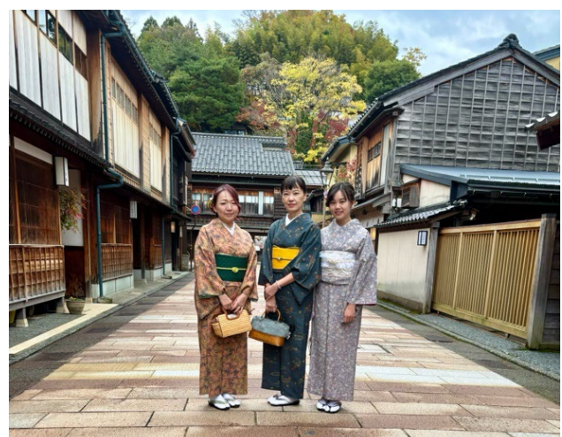
Kanazawa tour: exploring Higashi Chaya District and Kenroku-en, with Kimono experience.