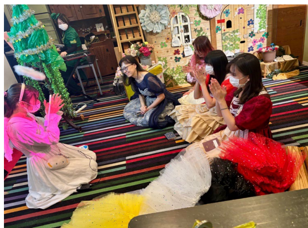
The angel is teaching the brushing song.