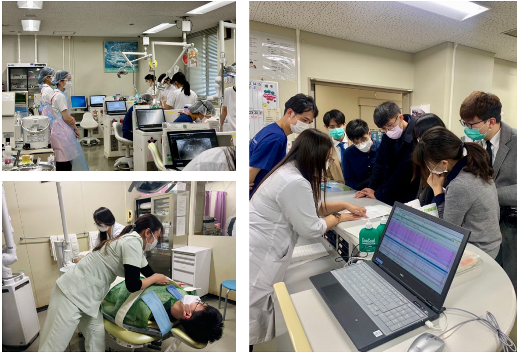
Visit to the clinic at the Department of Pediatric Dentistry.

Next, we visited the Department of Special Care Dentistry and toured its well-designed facilities. Thoughtful features include cushions for supporting patients with cerebral palsy, weighted blankets for comforting patients with autism, visual cards illustrating treatment steps, tactile tooth models for hands-on understanding by visually impaired patients, and papoose boards with a fishing net design that is durable and easy to clean in case of vomiting or spills. The clinic also utilizes anti-slip, shock-absorbing mats and elevated wiring systems to ensure smooth accessibility for wheelchair-bound patients. These details exude warmth and empathy toward patients with special needs.