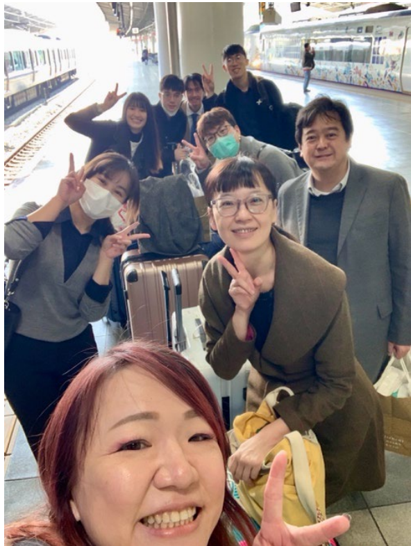
At Shin-Osaka Station on the Shinkansen, heading to Toyama.