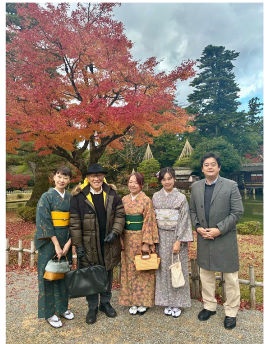
Charming autumn leaves in Kenroku-en

For lunch, we enjoyed delicious soba at the restaurant "Buemon Otoyu" in Higashi Chaya District, followed by a gold leaf ice cream dessert at "Hakuichi Higashiyama." After strolling through the quaint and historic streets of Higashi Chaya, we headed to Kenroku-en, one of the three most beautiful gardens in Japan. We were fortunate to visit at the end of autumn, when vibrant maple leaves and ginkgo trees brightened the scenery.