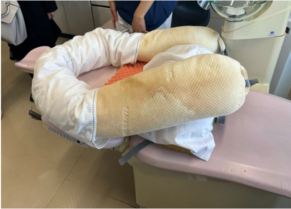
Special cushion for cerebral palsy patients