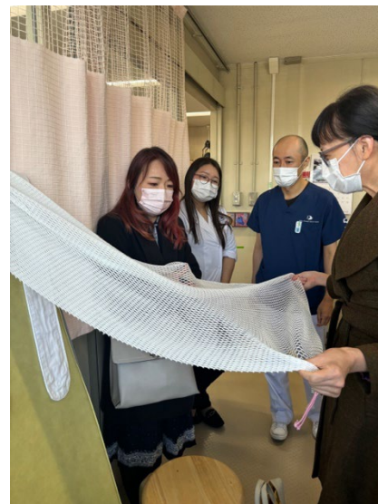
Papoose board with fishing net