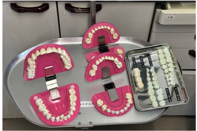
Tooth models for visually impaired patients