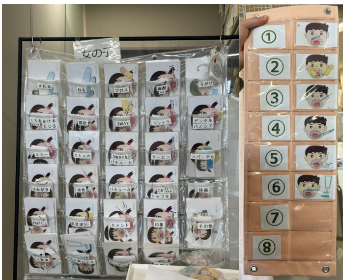
Visual cards illustrate treatment steps