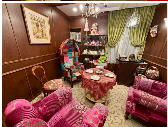
ASUNARO KINGDOM visit and activity experience.